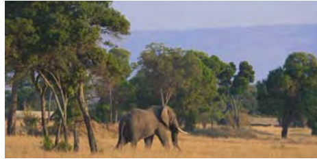
Mara Tented Camp