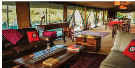
Ngorongoro Tented Camp