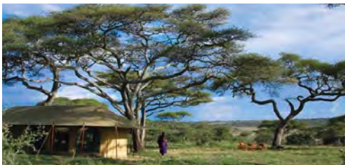
Ndutu Tented Camp