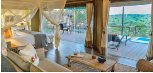
Kuria Hills Lodge