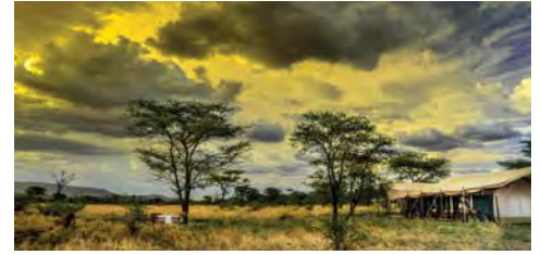
Ewanjan Tented Camp